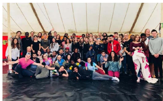
Pictured above, longtime grantee LIFEBeat hosted a summer camp at at Stanford Hall.

Our grant supports a student program studying Huckleberry Finn. Brown Rudnick's Hartford Office hosted the 2018- 2019 Relationship Grantee's from the Mark Twain House & Museum for a discussion of this past year's program.