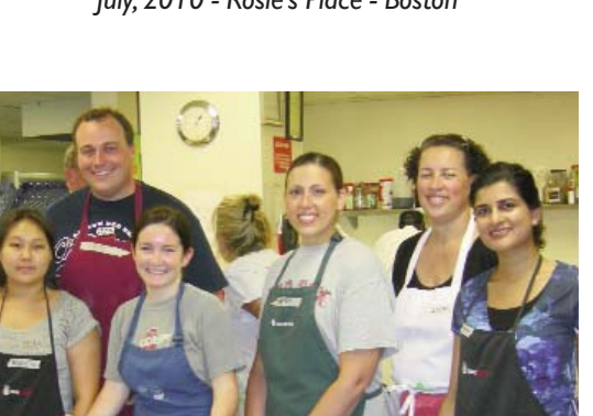
July, 2010 - Rosie's Place - Boston