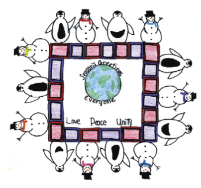
2010 - Brenda Hercules East Boston High School Untitled