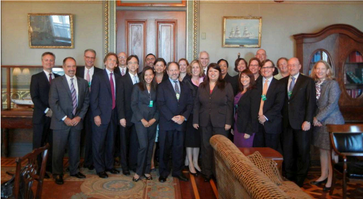
Photo: The Association of Pro Bono Counsel meeting in Washington, DC with Vice President Biden.

Issue 52 :: Summer (July – November) 2012 :: www.brownrudnickcenter.com