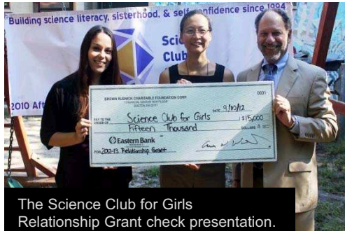
The Science Club for Girls Relationship Grant check presentation.