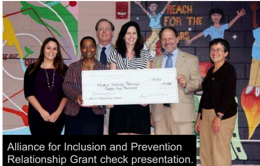
Alliance for Inclusion and Prevention Relationship Grant check presentation.