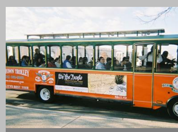
The US Capitol Historical Society's We the People Tour.

As a DC Public School teacher for the past six years, I'm always looking for opportunities to enhance my students' learning and expose them to new experiences. We the People Constitution Tour accomplished that and so much more. This tour allowed my 8th students an opportunity to visit the Department of Agriculture, the Supreme Court, the White House, the Lincoln Memorial, and the Capitol. The tour was convenient; it picked us up at my school, dropped us off, included lunch AND came with a tour guide who was entertaining and informative. My students had been studying the Constitution and the Bill of Rights, but it wasn't until we took the tour did the document really come alive for them. The information gained on the tour plus the new experiences (i.e. seeing the Constitution for the first time ever) was irreplaceable. I hope that all students are granted enriching opportunities such as this.