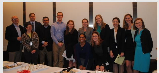
Brown Rudnick Attorneys and Staff at the Holiday Art Award Ceremony.