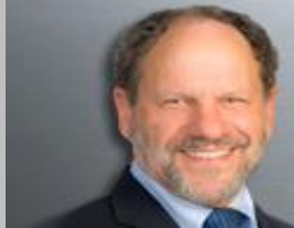
Al Wallis Center for the Public Interest Executive Director