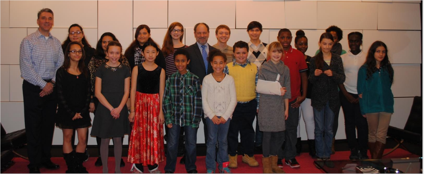
Boston Public School students celebrating the VLA Holiday Art Award Ceremony at the Brown Rudnick Boston office.